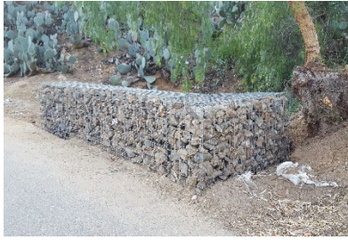
Along the road, gabions replace higher-upkeep straw bales - shown below. These mitigate runoff into neighbors' yards and homes.