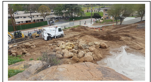
Photos at right are of “in progress” City Public Works and Parks Departments’ catch-basin project to control runoff from Glenwood / San Andreas corner of Mt. Rubidoux Park.